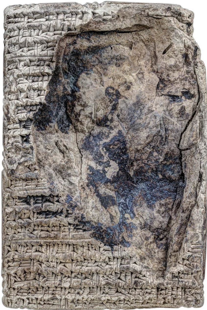
Fig. 1. Fragmentary obverse of the house sale contract YBC 7424 (Yale Oriental Series 17 3) from the third year of Babylonian king Nebuchadnezzar II, famous for burning the city of Jerusalem and exiling the Judean elite as described in the Book of Kings.

in digital form. For similar unsupervised language modeling tasks in English, for example, one can collect practically endless amounts of texts online, and the main limitation is the computational challenge of storing and processing large quantities of data (7). For cuneiform texts this is not the case. Automatic optical character recognition cannot be used to reliably identify cuneiform signs, neither in their two-dimensional (2D) representations (hand copies) nor in three-dimensional (3D) scans of actual clay tablets (8–12). Various visual recognition algorithms are being applied to cuneiform, but the results are yet in their infancy (13–16). Therefore, one has to rely on a limited corpus of manually transliterated texts. Although Akkadian cuneiform texts span more than two millennia and the genres available for study are heterogeneous, for many periods, only a